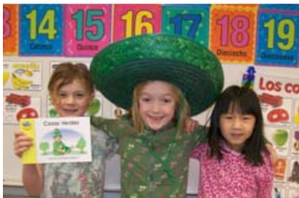
K-2 Students learning colors and numbers