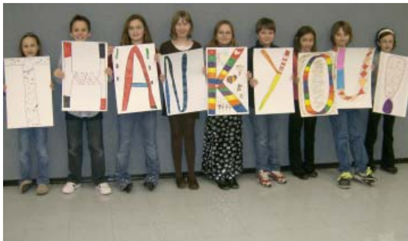
Grade 4 expresses their appreciation for the Wattsburg Area School District Board of Education during School Board Recognition Month with a GREAT BIG THANK-YOU!