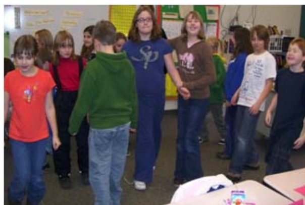
3rd and 4th graders practicing dance moves