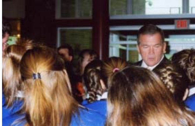
Tom Ridge talks to students at the opening of the Presque Isle Visitor Center on May 26, 2006